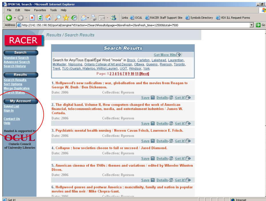
ZPortal 2.7.4: new in 2.7.4 additional links on the left hand navigation menu available to guest searchers

After searching, more links appear in the left hand navigation menu allowing guest users to check the search status, sort and merge their results, re-run searches, and save search results to a saved list: